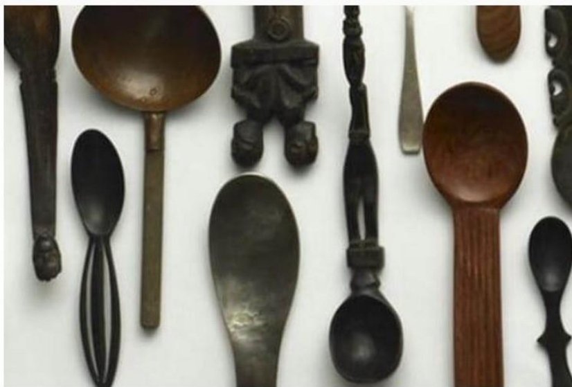
Origin of the Spoon - Inventor and Evolution. (2021, December 7). CurioSfera History.

Despite the fact that Neolithic spoons from twenty thousand years ago have been found in archaeological sites, it was in Ancient Egypt that their use became widespread. Spoons of ivory, stone, wood and even gold have been found in funerary trousseaus in Egyptian tombs, showing that that civilization gave great importance to this object.