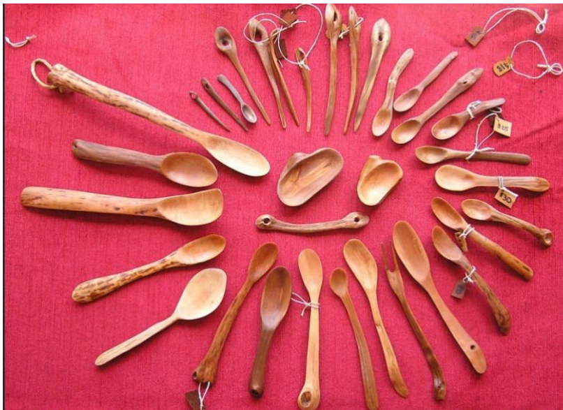
Figure 2. Spoons. (n.d.). Retrieved March 9, 2022.

The history of the spoon is really curious. Currently, we see it normal to see this object on a table, but you should know that over time, it has not always been like this.