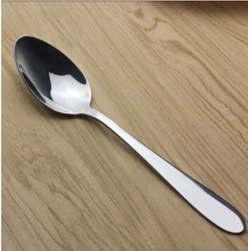
Figure 1. Taylor, A., & Madison. (n.d.). Cookware stuffs . Cookware Stuffs. Retrieved March 8, 2022,